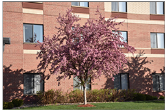
Robinson Flowering Crab in bloom

Robinson Flowering Crab is recommended for the following landscape applications;