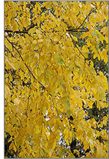
American Elm in fall

This tree should only be grown in full sunlight. It is an amazingly adaptable plant, tolerating both dry conditions and even some standing water. It is not particular as to soil type or pH, and is able to handle environmental salt. It is highly tolerant of urban pollution and will even thrive in inner city environments. This species is native to parts of North America.