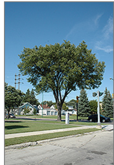
American Elm