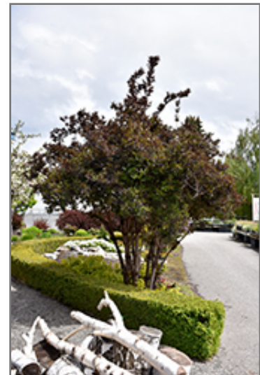
Black Beauty Elder