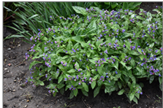
Dark Vader Lungwort in bloom