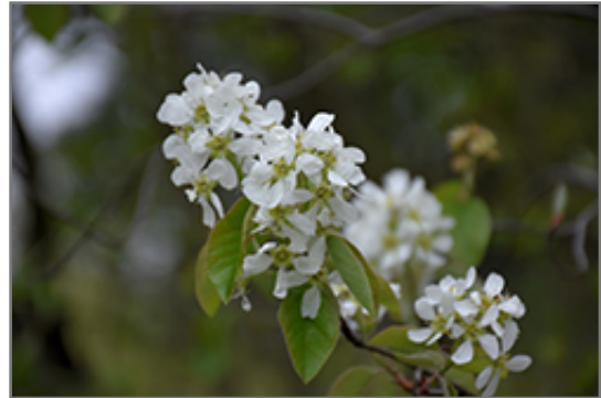
Saskatoon flowers

Saskatoon is a multi-stemmed deciduous shrub with an upright spreading habit of growth. Its relatively fine texture sets it apart from other landscape plants with less refined foliage.