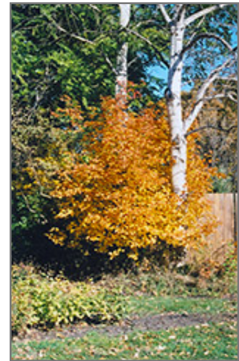
Saskatoon in fall