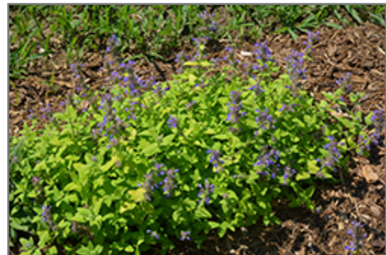
Chartreuse On The Loose Catmint in bloom