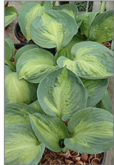
Adrian's Glory Hosta foliage

Adrian's Glory Hosta is recommended for the following landscape applications;