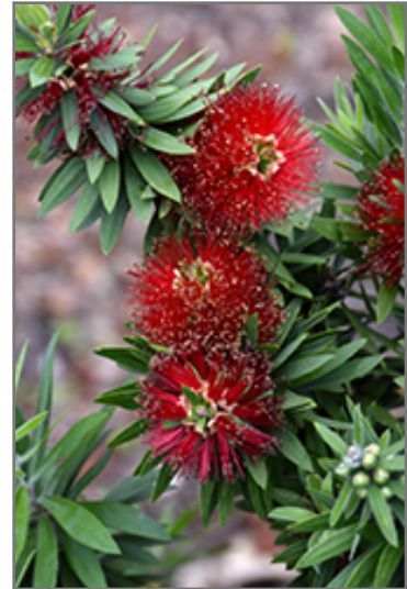
Light Show Bottlebrush flowers

Light Show Bottlebrush is recommended for the following landscape applications;