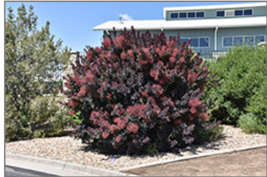
Lilla Smokebush in bloom

Lilla Smokebush is recommended for the following landscape applications;