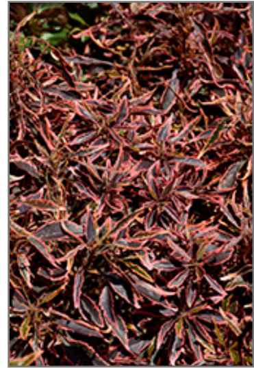
Firestorm Copperleaf foliage