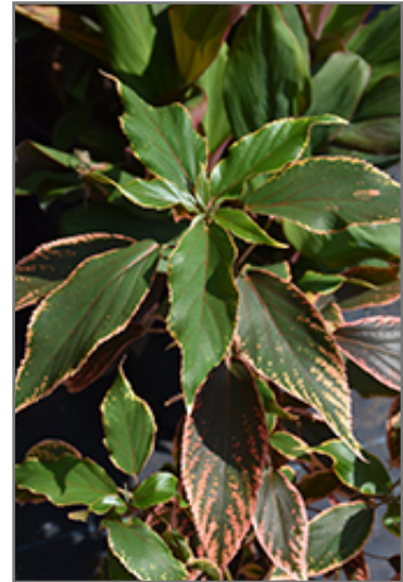
Bourbon Street Copper Plant foliage

Bourbon Street Copper Plant is recommended for the following landscape applications;