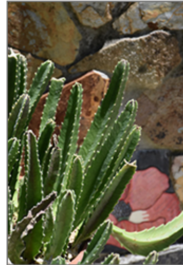
Zulu Giant