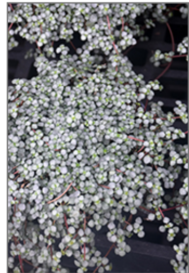
Aquamarine Pilea foliage