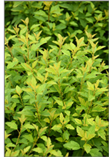
Raspberry Lemonade Ninebark foliage

Raspberry Lemonade Ninebark is recommended for the following landscape applications;