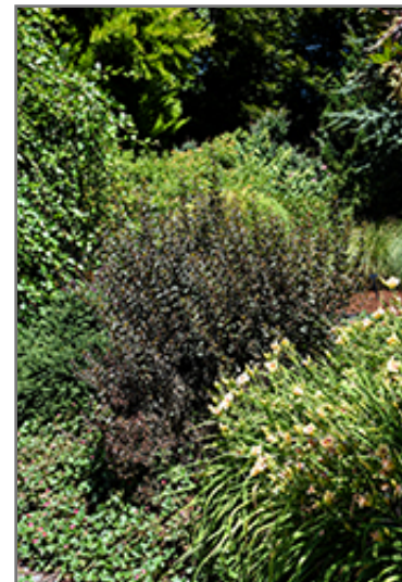
Little Joker Ninebark