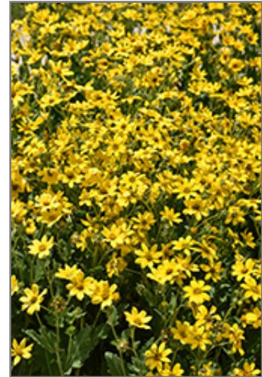
Engelmann's Daisy flowers

Engelmann's Daisy is recommended for the following landscape applications;