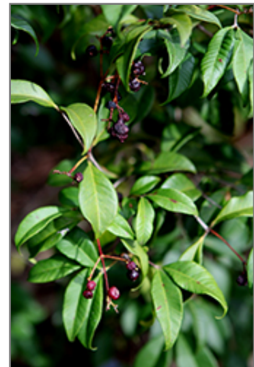
Spicewood fruit