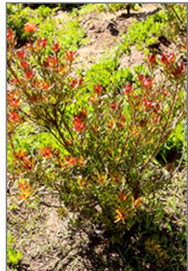
Safari Sunrise Conebush in spring