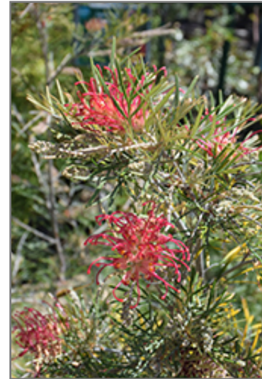
Spirit of ANZAC Grevillea flowers

Spirit of ANZAC Grevillea is recommended for the following landscape applications;