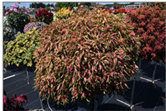
PartyTime Reggae Salmon Coleus