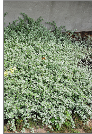
Silver Licorice Plant

Silver Licorice Plant is a fine choice for the garden, but it is also a good selection for planting in outdoor containers and hanging baskets. Because of its trailing habit of growth, it is ideally suited for use as a 'spiller' in the 'spiller-thriller-filler' container combination; plant it near the edges where it can spill gracefully over the pot. Note that when growing plants in outdoor containers and baskets, they may require more frequent waterings than they would in the yard or garden.