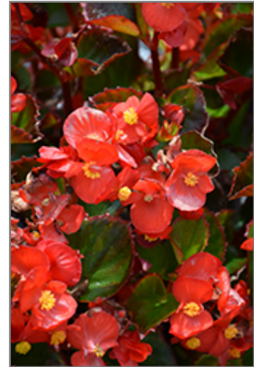
Ambassador Scarlet Begonia flowers

This is a high maintenance plant that will require regular care and upkeep, and usually looks its best without pruning, although it will tolerate pruning. Deer don't particularly care for this plant and will usually leave it alone in favor of tastier treats. Gardeners should be aware of the following characteristic(s) that may warrant special consideration;