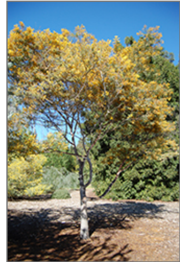
Mudgee Wattle in bloom

This is a relatively low maintenance tree, and should only be pruned after flowering to avoid removing any of the current season's flowers. It is a good choice for attracting birds, bees and butterflies to your yard, but is not particularly attractive to deer who tend to leave it alone in favor of tastier treats. Gardeners should be aware of the following characteristic(s) that may warrant special consideration;