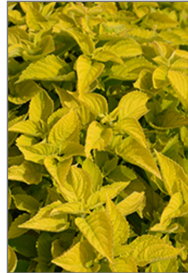
Chartres Street Coleus foliage

Chartres Street Coleus is recommended for the following landscape applications;