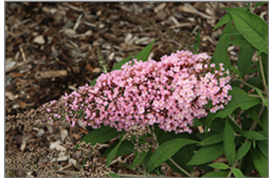
Pink Cascade II Butterfly Bush flowers

Pink Cascade II Butterfly Bush is an open multi-stemmed deciduous shrub with a shapely form and gracefully arching branches. Its average texture blends into the landscape, but can be balanced by one or two finer or coarser trees or shrubs for an effective composition.