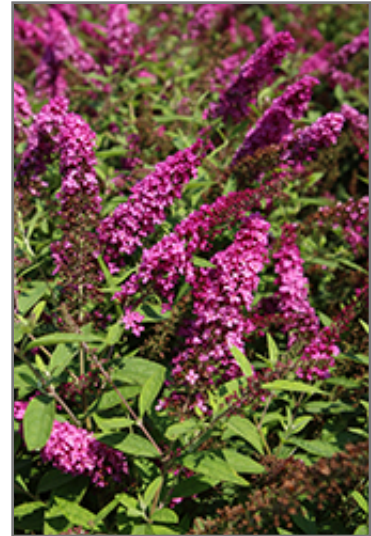
Lo & Behold Ruby Chip Butterfly Bush flowers

Lo & Behold Ruby Chip Butterfly Bush is a multi-stemmed deciduous shrub with a mounded form. Its average texture blends into the landscape, but can be balanced by one or two finer or coarser trees or shrubs for an effective composition.