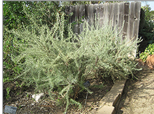
California Sagebrush

California Sagebrush is recommended for the following landscape applications;