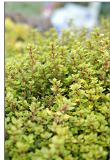
Archer's Gold Thyme flowers