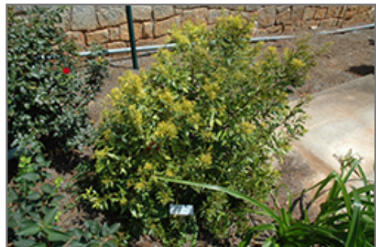
Pat's Gold Southern Wax Myrtle in bloom