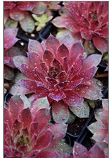
More Honey Hens And Chicks