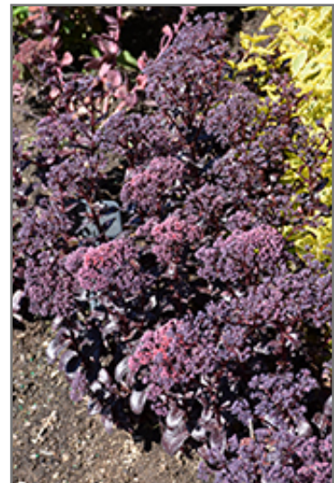
Dark Magic Stonecrop in bloom