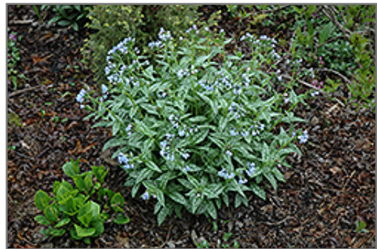
Roy Davidson Lungwort in bloom