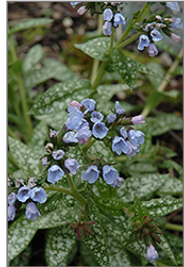
Roy Davidson Lungwort flowers