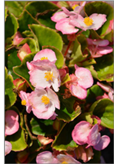
Sprint Plus Apple Blossom Begonia flowers

This is a high maintenance plant that will require regular care and upkeep, and usually looks its best without pruning, although it will tolerate pruning. Deer don't particularly care for this plant and will usually leave it alone in favor of tastier treats. Gardeners should be aware of the following characteristic(s) that may warrant special consideration;