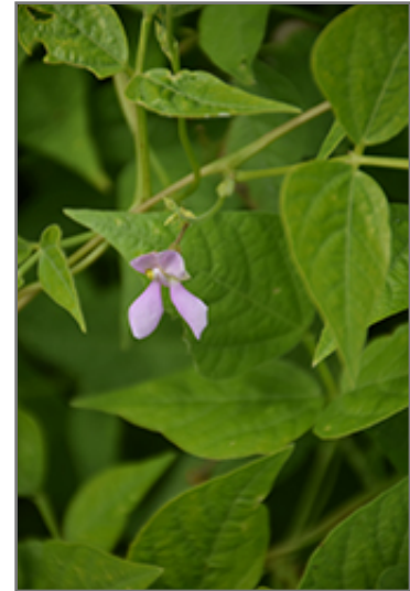
Golden Wax Bean flowers

Golden Wax Bean will grow to be about 10 feet tall at maturity, with a spread of 24 inches. When planted in rows, individual plants should be spaced approximately 12 inches apart. Because of its vigorous growth habit, it may require staking or supplemental support. This fast-growing vegetable plant is an annual, which means that it will grow for one season in your garden and then die after producing a crop. Because of its relatively short time to maturity, it lends itself to a series of successive plantings each staggered by a week or two; this will prolong the effective harvest period.