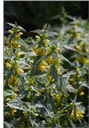
Silver Spangled Yellow Archangel flowers

Silver Spangled Yellow Archangel is recommended for the following landscape applications;