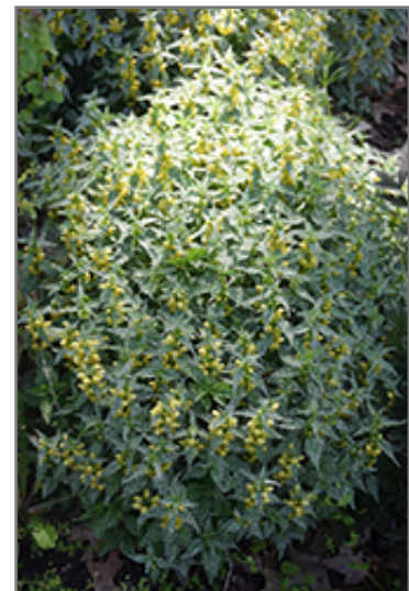
Silver Spangled Yellow Archangel in bloom