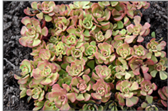
Pink Form Southern Stonecrop

This plant will require occasional maintenance and upkeep, and is best cleaned up in early spring before it resumes active growth for the season. Deer don't particularly care for this plant and will usually leave it alone in favor of tastier treats. Gardeners should be aware of the following characteristic(s) that may warrant special consideration;