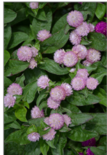
Ping Pong Lavender Globe Amaranth flowers