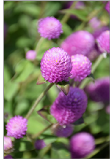
Ping Pong Lavender Globe Amaranth flowers

Ping Pong Lavender Globe Amaranth is recommended for the following landscape applications;