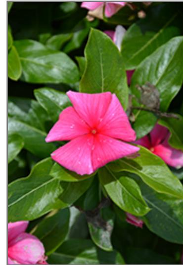
Cora XDR Deep Strawberry flowers

Cora XDR Deep Strawberry is recommended for the following landscape applications;