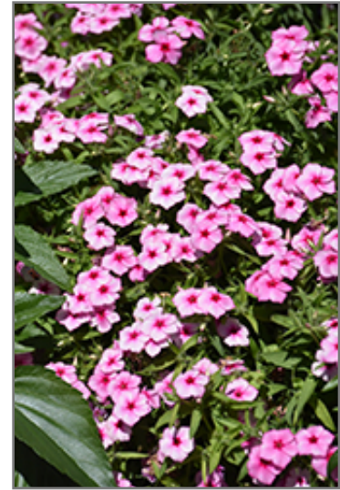
Gisele Pink Phlox flowers

Gisele Pink Phlox is recommended for the following landscape applications;