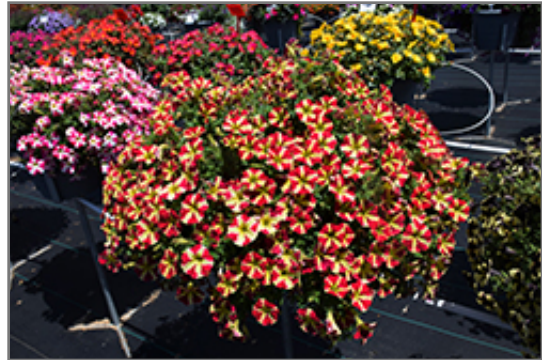
Amore Queen of Hearts Petunia in bloom

Amore Queen of Hearts Petunia will grow to be about 12 inches tall at maturity, with a spread of 14 inches. When grown in masses or used as a bedding plant, individual plants should be spaced approximately 10 inches apart. Its foliage tends to remain dense right to the ground, not requiring facer plants in front. This fast-growing annual will normally live for one full growing season, needing replacement the following year.