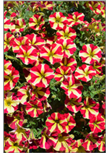
Amore Queen of Hearts Petunia flowers

This plant will require occasional maintenance and upkeep. Trim off the flower heads after they fade and die to encourage more blooms late into the season. It is a good choice for attracting butterflies and hummingbirds to your yard, but is not particularly attractive to deer who tend to leave it alone in favor of tastier treats. It has no significant negative characteristics.