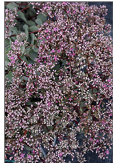
Pink Mongolian Stonecrop flowers