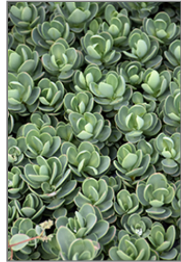
Pink Mongolian Stonecrop foliage

Pink Mongolian Stonecrop is a fine choice for the garden, but it is also a good selection for planting in outdoor pots and containers. It is often used as a 'filler' in the 'spiller-thriller-filler' container combination, providing a mass of flowers and foliage against which the thriller plants stand out. Note that when growing plants in outdoor containers and baskets, they may require more frequent waterings than they would in the yard or garden.