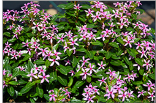
Soiree Kawaii Light Purple Vinca flowers

This plant will require occasional maintenance and upkeep, and should not require much pruning, except when necessary, such as to remove dieback. It is a good choice for attracting butterflies to your yard, but is not particularly attractive to deer who tend to leave it alone in favor of tastier treats. It has no significant negative characteristics.