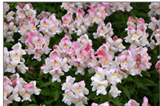
Snapshot Appleblossom Snapdragon flowers