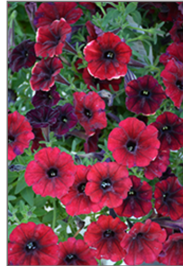
Supertunia Black Cherry Petunia flowers

Supertunia Black Cherry Petunia is a dense herbaceous annual with a trailing habit of growth, eventually spilling over the edges of hanging baskets and containers. Its medium texture blends into the garden, but can always be balanced by a couple of finer or coarser plants for an effective composition.