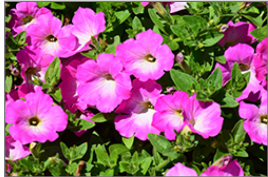
Opera Supreme Pink Morn Petunia flowers

This plant will require occasional maintenance and upkeep. Trim off the flower heads after they fade and die to encourage more blooms late into the season. It is a good choice for attracting butterflies and hummingbirds to your yard, but is not particularly attractive to deer who tend to leave it alone in favor of tastier treats. It has no significant negative characteristics.