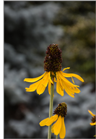
Giant Coneflower flowers

Giant Coneflower is a fine choice for the garden, but it is also a good selection for planting in outdoor pots and containers. With its upright habit of growth, it is best suited for use as a 'thriller' in the 'spiller-thriller-filler' container combination; plant it near the center of the pot, surrounded by smaller plants and those that spill over the edges. It is even sizeable enough that it can be grown alone in a suitable container. Note that when growing plants in outdoor containers and baskets, they may require more frequent waterings than they would in the yard or garden.