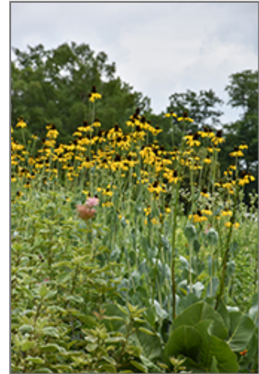
Giant Coneflower in bloom

Giant Coneflower is recommended for the following landscape applications;