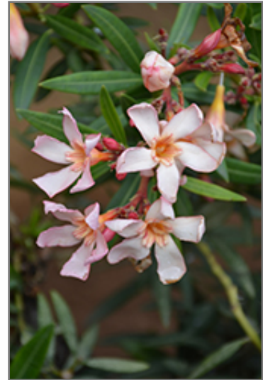
Sofia Oleander flowers

Sofia Oleander is recommended for the following landscape applications;