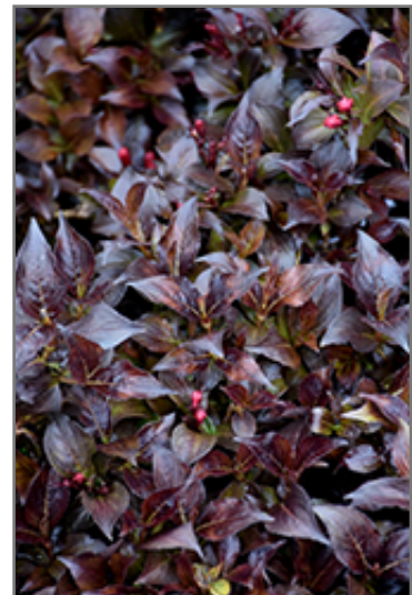
Coco Krunch Weigela foliage