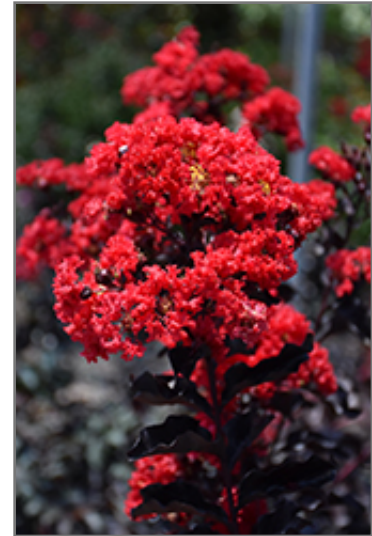
Black Diamond Best Red Crapemyrtle flowers

Black Diamond Best Red Crapemyrtle is recommended for the following landscape applications;