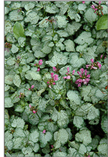
Beacon Silver Spotted Dead Nettle flowers