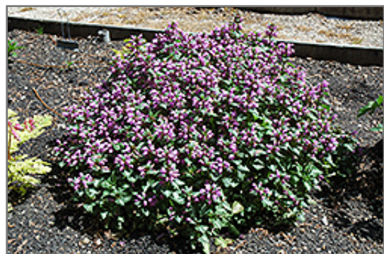
Beacon Silver Spotted Dead Nettle in bloom